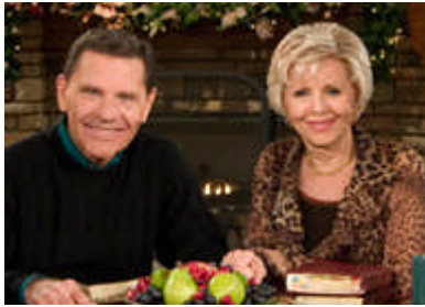
Kenneth and Gloria Copeland

Kenneth Copeland Ministries was founded on the uncompromising, infallible, unchanging Word of God. Kenneth and Gloria Copeland have determined to walk by faith, preach the truth of God's Word and His unconditional love. That's why, after 40 years, the only thing that has changed is the way the message — JESUS IS LORD — has traveled across the globe in a variety of more-accessible formats.